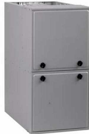
Illustrations and photographs are only representative. Some product models may vary.

* Applies to original purchaser/homeowner, some limitations may apply. See warranty certificate for complete details.